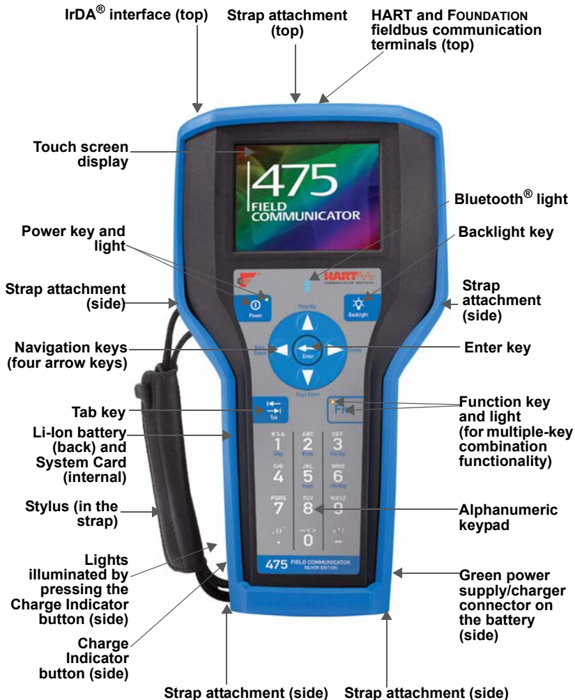
Figure 1. 475 Field Communicator with the Protective Rubber Boot